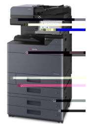
Kyocera TASKalfa 3554ci Multifunction Product

“The control software that we had verified in advance on ARC EV implemented in the Synopsys HAPS Prototyping System worked with almost no additional modification needed,” said Okada.