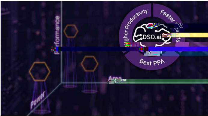
Figure 1: DSO.ai provides unbeatable PPA results and the fastest time to design

Complexity brought on by advanced process nodes have opened the door to challenges in achieving optimal power, performance, and area. Manual methods are no longer viable given shrinking market windows. The need to drive for better